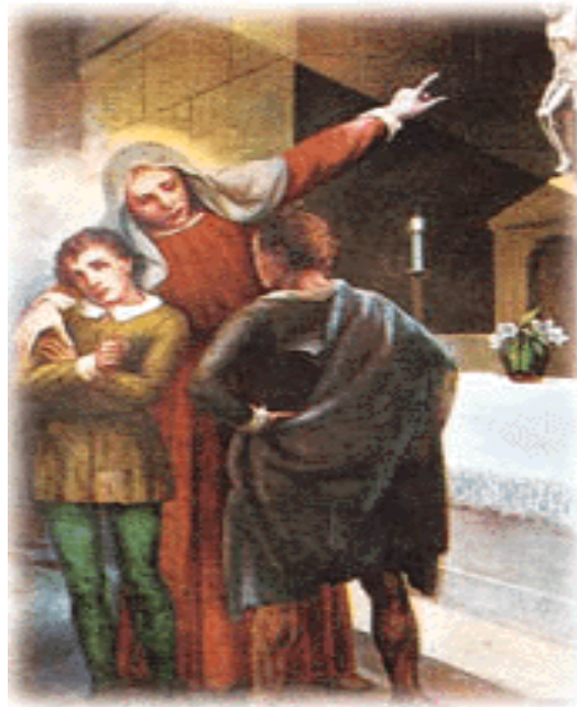
Saint Rita with Her Two Boys